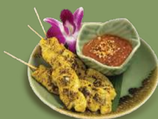
BBQ Chicken Satay 黃薑雞肉沙嗲 N (3pcs串) +$28