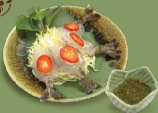
Prawn Carpaccio 泰式生蝦 (4pcs隻) +$38