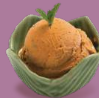
◆ Ice Cream 雪糕球 (Coconut / Thai Milk Tea) (椰子 / 泰式奶茶) +$28 per scoop 每球