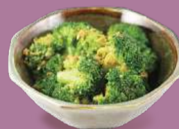
Stir-fried Broccoli with Garlic 香蒜炒西蘭花 +$28