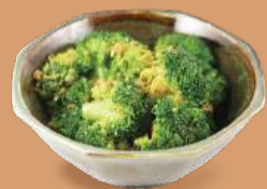
Stir-fried Broccoli with Garlic 香蒜炒西蘭花 +$28