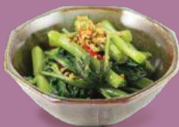
Stir-fried Morning Glory 泰式炒通菜 +$28