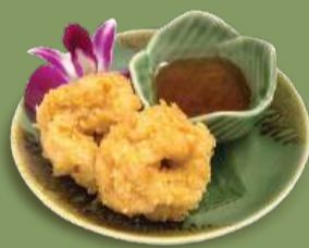
Shrimp Cakes 香脆蝦餅 (2pcs件) +$28