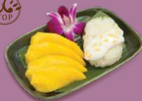
Mango Sticky Rice with Coconut Milk 芒果糯米飯伴椰奶 +$38