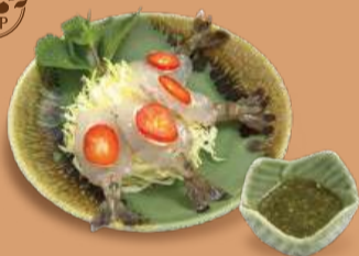
Prawn Carpaccio 泰式生蝦 (4pcs隻) +$38