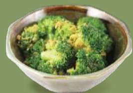
Stir-fried Broccoli with Garlic 香蒜炒西蘭花 +$28