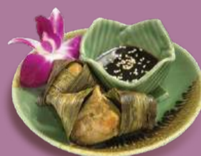
Chicken Pandan 班蘭香葉包雞 (2pcs 件) +$22