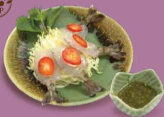
Prawn Carpaccio 泰式生蝦 (4pcs 隻) +$38