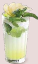
Green Apple Mint Soda 青蘋果薄荷梳打 +$18