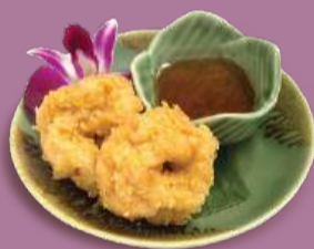
◆ Shrimp Cakes 香脆蝦餅 (2pcs 件) +$28