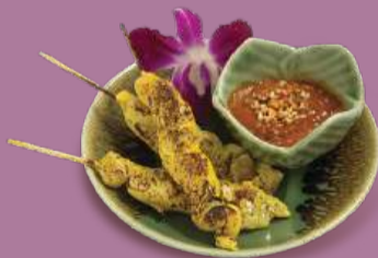
BBQ Pork Satay 黃薑豬肉沙嗲 N (3pcs 串) +$28