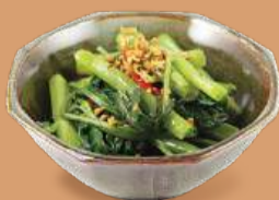
Stir-fried Morning Glory 泰式炒通菜 +$28