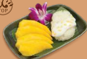
Mango Sticky Rice with Coconut Milk 芒果糯米飯伴椰奶 +$38