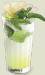
Green Apple Mint Soda 青蘋果薄荷梳打 +$18