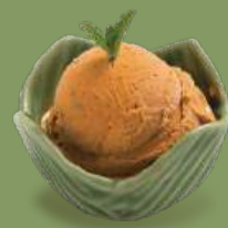
Ice Cream 雪糕球 (Coconut / Thai Milk Tea) (椰子 / 泰式奶茶) +$28 per scoop 每球