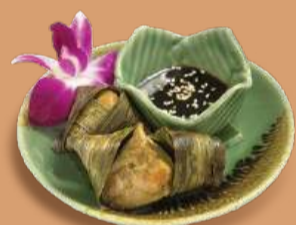
Chicken Pandan 班蘭香葉包雞 (2pcs件) +$22