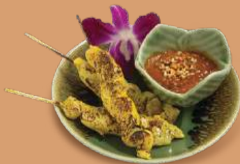
BBQ Pork Satay 黃薑豬肉沙嗲 N (3pcs串) +$28