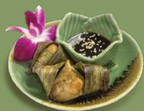
Chicken Pandan 班蘭香葉包雞 (2pcs件) +$22