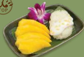
Mango Sticky Rice with Coconut Milk 芒果糯米飯伴椰奶 +$38