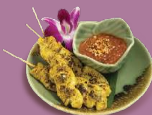
BBQ Chicken Satay 黃薑雞肉沙嗲 N (3pcs 串) +$28