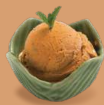
◆ Ice Cream 雪糕球 (Coconut / Thai Milk Tea) (椰子 / 泰式奶茶) +$28 per scoop 每球