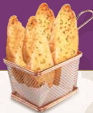
香脆蒜蓉包 Crispy Garlic Bread