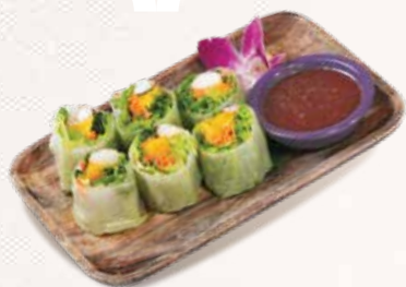
芒果大蝦米紙卷 Mango & Prawn Rice Paper Roll