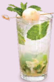
荔枝薄荷梳打 Lychee & Mint Soda