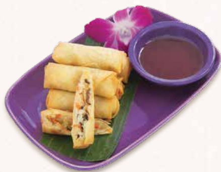
泰式脆春卷 Vegetarian Spring Roll