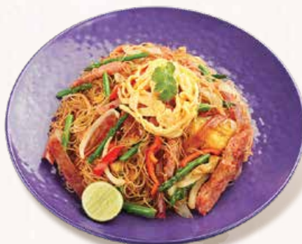
泰式街頭炒米粉 Thai Fried Rice Vermicelli