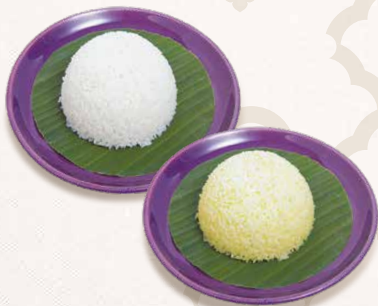
雞油飯/白飯 Chicken Rice / Jasmine Rice