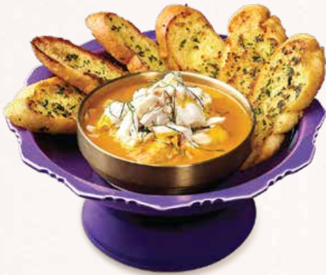
黃咖喱珍寶蟹肉 配蒜蓉包 Jumbo Crab Meat Yellow Curry with Garlic Bread