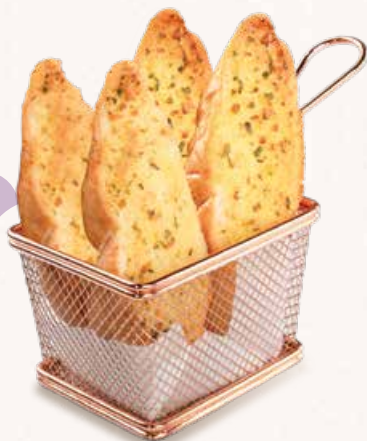
香脆蒜蓉包 Crispy Garlic Bread