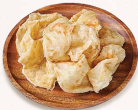
印度薄餅 Roti Prata