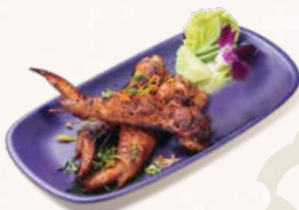
香茅椰糖燒雞全翼 BBQ Lemongrass Whole Chicken Wing