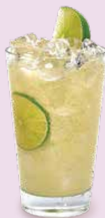
青檸梳打 Fresh Lime Soda