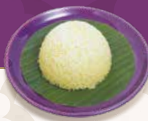
雞油飯 Chicken Rice