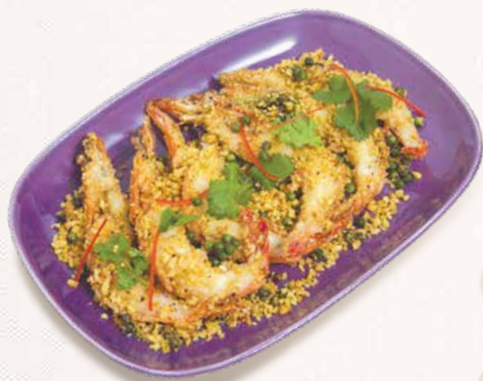
蒜香胡椒炒大蝦 Stir-fried Tiger Prawns with Garlic & Peppercorn