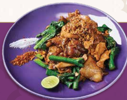
泰式大蝦/豬肉/雞肉炒河粉 Fried Rice Noodles with Prawns / Pork / Chicken