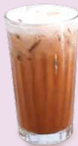
泰式咖啡 Thai Coffee (hot/cold)