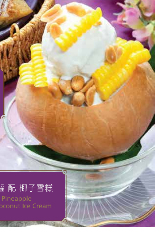
燒菠蘿 配 椰子雪糕 Grilled Pineapple with Coconut Ice Cream