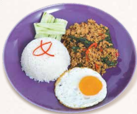
泰式肉碎煎蛋飯 Minced Pork & Fried Egg with Jasmine Rice