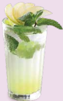
青蘋果薄荷梳打 Green Apple Mint Soda