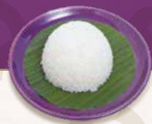
白飯 Jasmine Rice