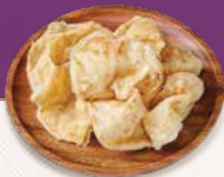
印度薄餅 Roti Prata