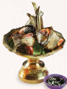
班蘭香葉包雞 Homemade Chicken Pandan