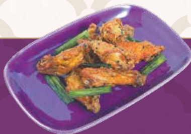
香脆魚露雞翼 Crispy Chicken Wing