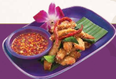
香脆芝麻豬頸肉 Deep-fried Pork Neck