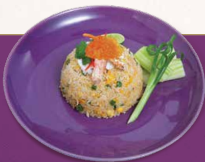
蟹肉炒飯 Fried Rice with Crab Meat