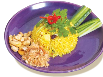
SET D/ 菠蘿肉鬆海鮮雞肉炒飯 Pineapple Fried Rice with Seafood, Chicken & Pork Floss + 泰式鹹魚炒芥蘭 Stir-fried Kale with Salted Fish + 扎肉米紙卷 Pork Salami Rice Paper Rolls with Thai Spicy Herb Sauce