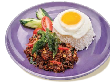
SET F/ 拋豬引肉碎煎蛋飯 "Meat Zero" Minced Pork Fried Egg with Rice + 黃咖喱雜菜 Mixed Vegetables Yellow Curry + 穩打穩扎肉米紙卷 "Meat Zero" Thai Salami Rice Paper Rolls