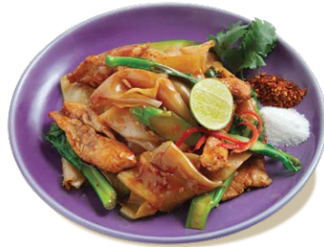
SET B/ 泰式豬肉炒河粉 Fried Rice Noodles with Pork + 香蒜炒雜菜 Stir-fried Seasonal Mixed Vegetables with Garlic + 燒雞扒 Grilled Chicken Steak