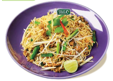
SET E/ 香辣素肉碎炒麵 "Meat Zero" Spicy Minced Pork Fried Noodles + 泰式脆春卷 Vegetarian Spring Rolls + 紅咖喱南瓜豆卜 Pumpkin & Tofu Puff Red Curry