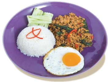
SET C/ 泰式肉碎煎蛋飯 Minced Pork & Fried Egg with Jasmine Rice + 香蒜炒西蘭花 Stir-fried Broccoli with Garlic + 香脆蝦餅 Shrimp Cake