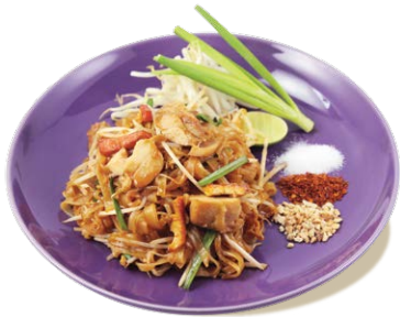
SET A/ 泰式雞肉炒金邊粉 Phad Thai with Chicken + 香蒜炒菠菜 Stir-fried Spinach with Garlic + 泰式魚餅 Thai Fish Cake