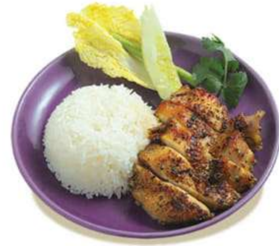
SET E/ 燒雞扒 配白飯 Grilled Chicken with Jasmine Rice $88