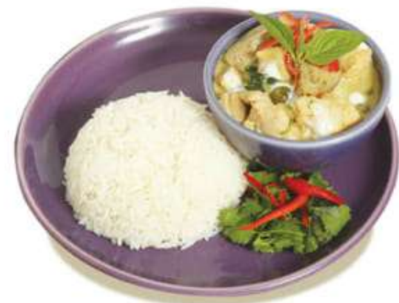
TOP SET A/ 青咖喱雞 配白飯 Chicken Green Curry with Jasmine Rice $88