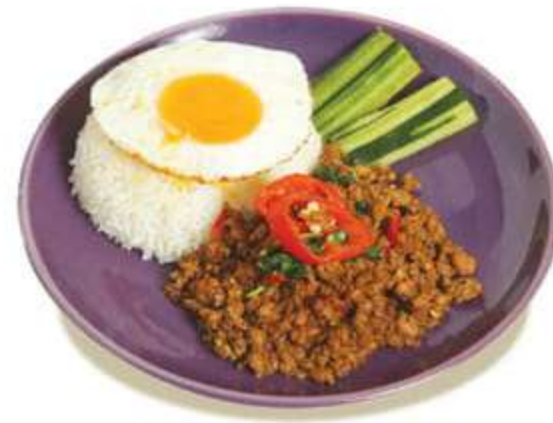
SET F/ 泰式肉碎煎蛋飯 Minced Pork & Fried Egg with Rice $68