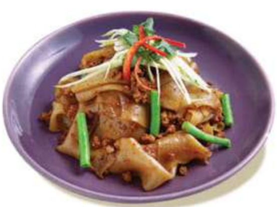
SET H/ 泰式豬肉炒河粉 Fried Rice Noodles with Pork $98