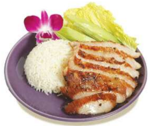
SET D/ 燒豬頸肉 配白飯 Grilled Pork Neck with Jasmine Rice $98