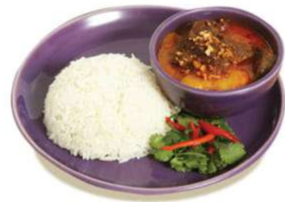
SET C/ 馬沙文咖喱牛腩 配白飯 Beef Shin Massaman Curry with Jasmine Rice $98