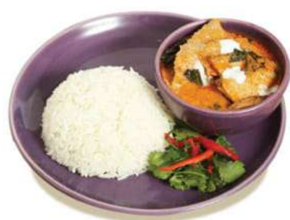
SET B/ 紅咖喱豬頸肉 配白飯 Pork Neck Red Curry with Jasmine Rice $88