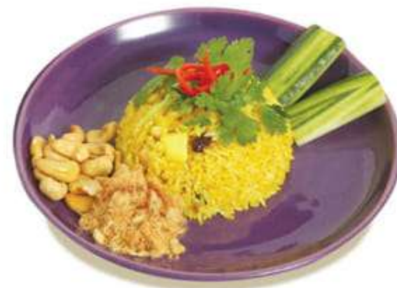
SET G/ 菠蘿肉鬆雞肉炒飯 Pineapple Fried Rice with Chicken & Pork Floss $88