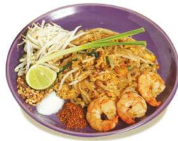
SET I/ 泰式炒金邊粉 Phad Thai with Prawns $118